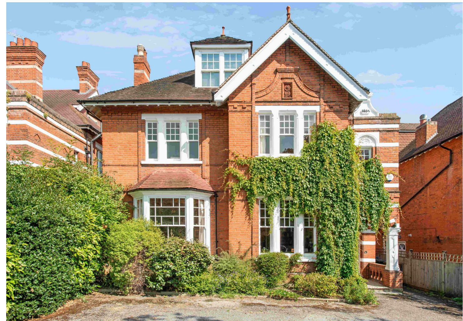
10 Edge Hill, Wimbledon, SW19 4LP